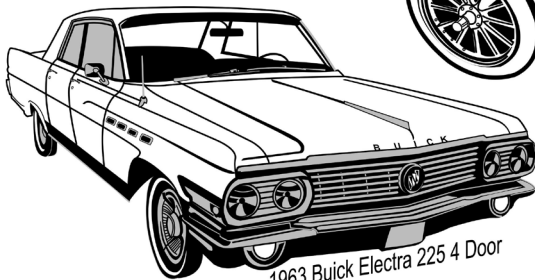
1963 Buick Electra 225 4 Door